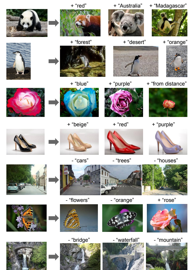
Figure 5. Image retrieval with image \pm text queries. We add (or subtract) text query embedding to (or from) the image query embedding, and then use the resulting embedding to retrieve relevant images using cosine similarity.

Previously word2vec (Mikolov et al., 2013a;b) shows that linear relationships between word vectors emerge as a result of training them to predict adjacent words in sentences and paragraphs. We show that linear relationships between