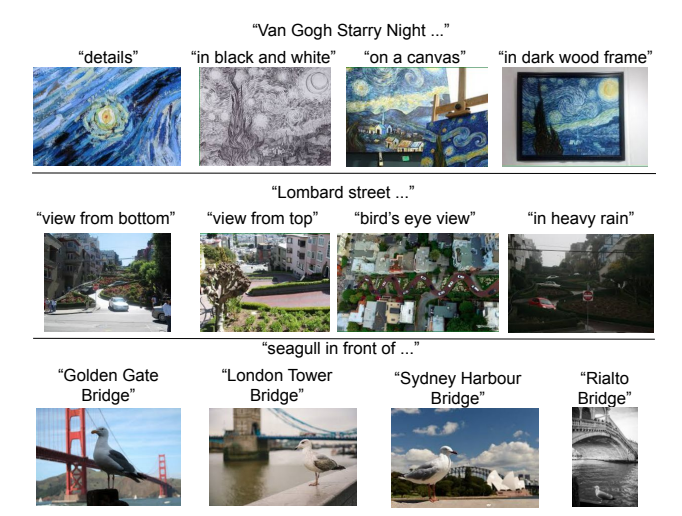
Figure 4. Image retrieval with fine-grained text queries using ALIGN's embeddings.

We build a simple image retrieval system to study the behaviors of embeddings trained by ALIGN. For demonstration purposes, we use an index consisting of 160M CC-BY licensed images that are separate from our training set. Figure 4 shows the top 1 text-to-image retrieval results for a handful of text queries not existing in the training data. ALIGN can retrieve precise images given detailed descriptions of a scene, or fine-grained or instance-level concepts like landmarks and artworks. These examples demonstrate that our ALIGN model can align images and texts with similar semantics, and that ALIGN can generalize to novel complex concepts.