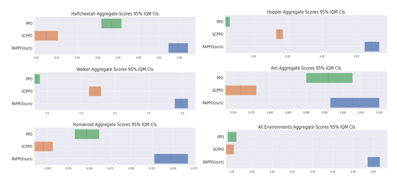
Figure 4. The interquartile mean (IQM) reveals the aggregated results across the strengths of perturbation in each environment and across strengths and environments.