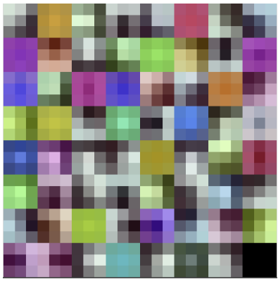
(a) Pretrained VGGNet