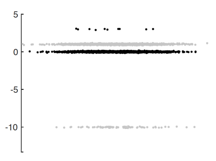
Fig. 1 An illustrative distribution of data. Positive observations are gray and negative observations are black. Solution 1 ranks observations from top to bottom, and Solution 2 ranks solutions from bottom to top.

Another way to say this is that the convexification "washes out" the differences between rank statistics. If we were directly to optimize the rank statistic of interest, the problem discussed above would vanish.