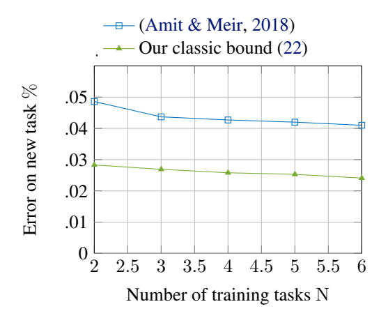
Figure 2: The average test error of learning a new task versus N. The number of training example of each task 8000. The number of epochs is 400.