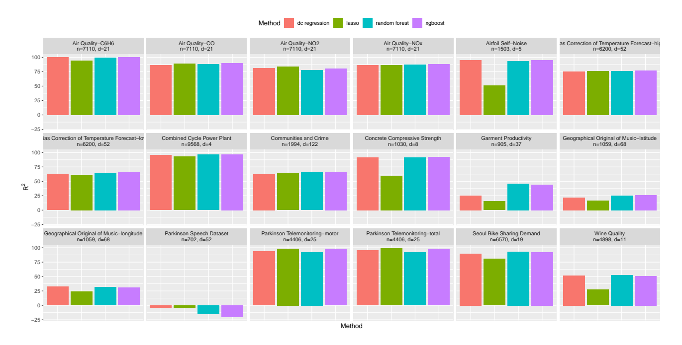
Figure 1. Regression results on UCI datasets