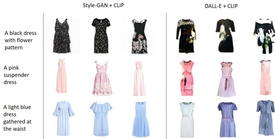
Figure 1: Examples of text-to-image generation. For each text prompt on the left, the first 3 images are found using StyleGAN+CLIP and the second 3 images are generated by DALL-E.