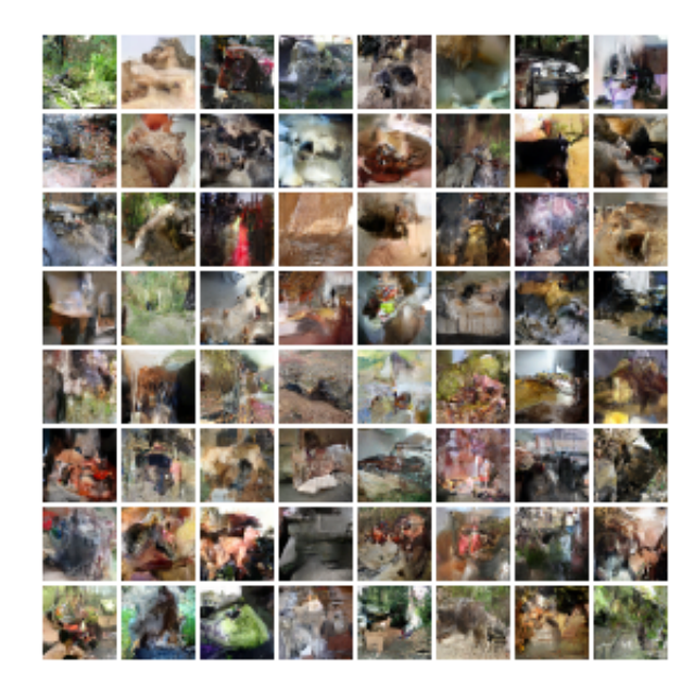
Figure 2: Left : Samples generated by using a pretrained model on CIFAR10 dataset. Right : Samples generated by using a pretrained model on ImageNet32 dataset.

as a simple function, for example, a quadratic function in v. In FFJORD, the integrand needs to be a neural network with D input variables x_1,\ldots,x_D . To evaluate the integral of such a complicated integrand accurately, a large number of quadrature nodes are needed, which will increase the cost in both forward and backward transformations. Additionally, AUTM enables the use of user-defined integrand g, which will be beneficial if prior information of the transformation to be learned is available.